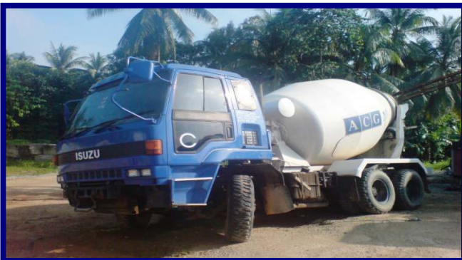
5 units Mixer Truck